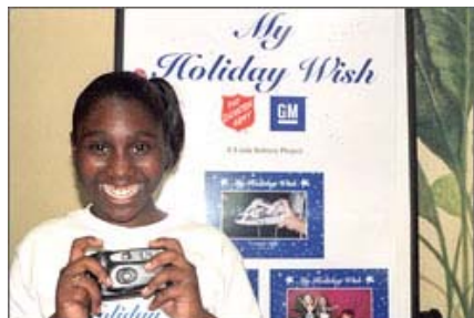
Enlarge